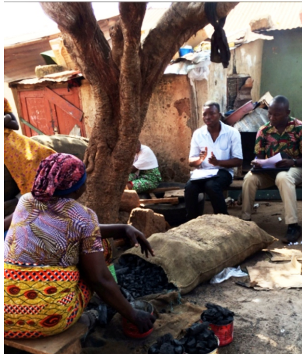
An interviewer conducts the pre-DP survey with a participant

While deliberators were willing to ban waste water for vegetable farming they were very interested in supporting other