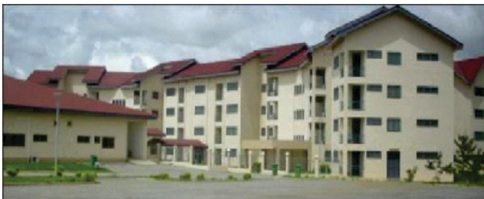
Rapidly urbanizing Tamale

The DP method offers certain advantages over other methods of public consultation. Self-selected town meetings are unlikely to be representative because they only involve those who feel strongly enough to attend. Focus groups cannot be used to represent opinion because they are too small to be statistically meaningful. Rather, they are useful for uncovering the way the public frames an issue as a step in facilitating more systematic research. Conventional polls, while potentially