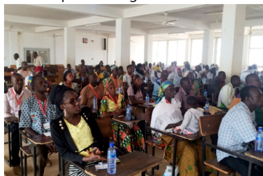
Deliberators during a plenary session

An extensive advisory group of stakeholders, NGOs, academic experts and government officials developed and vetted the briefing discussion materials around Water, Sanitation and Hygiene, Livelihood and Food Security (see Appendix Table C for list). Their work built on previous focus groups and key informant interviews. The two days of discussion were divided as follows: Livelihood and Food Security on day one, then Water, Sanitation and Hygiene on day two. Given the low literacy rate of the population, a fifteen-minute video version of the briefings was produced and shown at the beginning of each day of deliberation.