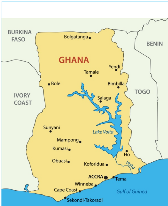
Map of Ghana

The West Africa Resilience Innovation Lab (WA RILab), working in close collaboration with the Center for Deliberative Democracy (CDD) at Stanford University, conducted Ghana's first Deliberative Poll (DP) in January 2015. A random, representative sample of the Tamale Metropolitan Area was convened for a two-day deliberation in Tamale. The participants in Tamale deliberated face-to-face on January 10-11, 2015.