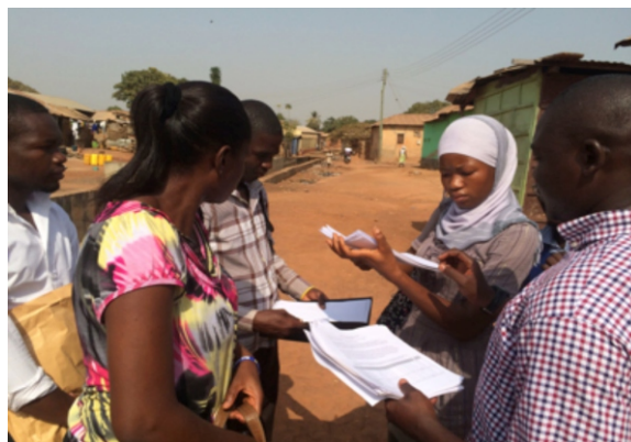
Interviewers in Tamale

Thirty five respondents completed the baseline survey but did not attend the deliberations. A total of 208 persons completed the actual two days of deliberations. Tables A and B in the Appendix show that there were very few significant differences between the participants and non-participants in either demographics or attitudes. The response rate was 85%, a very high level by world standards for surveys and even more remarkable for two days of deliberation. The sample was 48% male with an average age of 33.7 years. In terms of education,