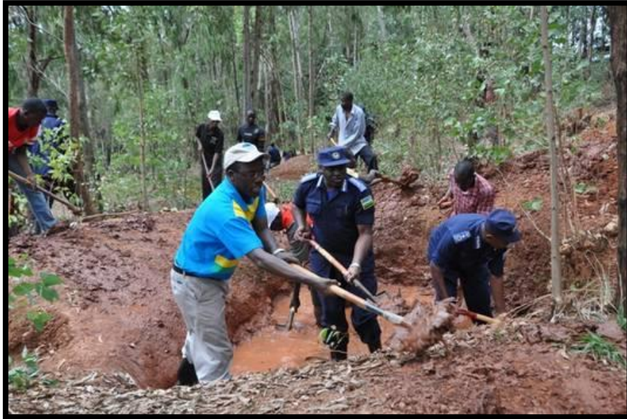
Police join other citizens in monthly community work ( umuganda ) (photo: http://eng/IGIHE.com/news/ , September 29, 2013)