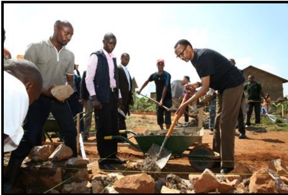
President Kagame joining residents of Masaka Sector, Kicukiro District, during monthly umuganda to build homes for genocide survivors